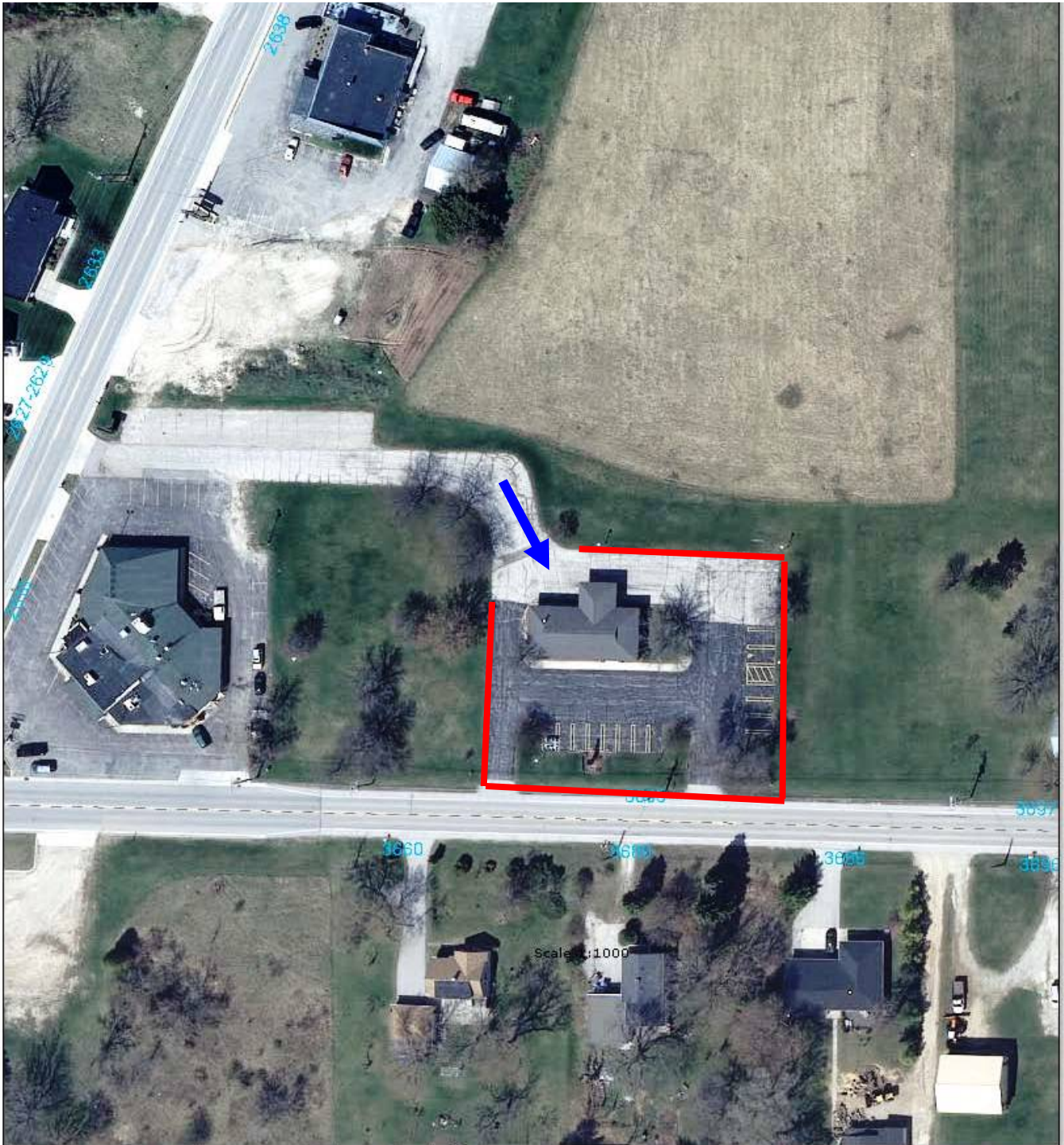
Map of Brown County, Wisconsin provided by the Planning & Land Services Department - Land Information Office (LIO). This map is intended for advisory purposes only. It is based on sources believed to be reliable, but Brown County distributes this information on an "As Is" basis. No warranties are implied.

The information above has been obtained from sources believed reliable. While we do not doubt its accuracy, we have not verified it and make no guarantee, warranty or representation about it. It is your responsibility to independently confirm its accuracy and completeness. Any projections, opinions, assumptions, or estimates used are for example only and do not represent the current or future performance of the property. The value of this transaction to you depends on tax and other factors which should be evaluated by your tax, financial, and legal advisors. You and your advisors